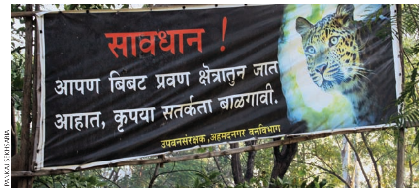
A forest department hoarding warns against leopards

leopard attacks were reported for the first time in the last two months of 2003 in villages that had not seen any attacks till then. The attacks stopped only when trap cages were put there and two leopards caught. These were the same animals that had only a few months earlier terrorised people in the agriculture-dominated landscape of Junnar.